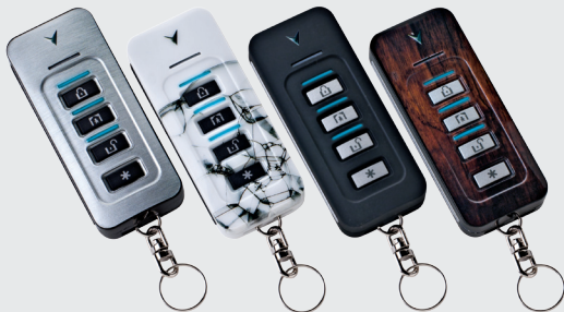
Metal Bubbles Black Wood